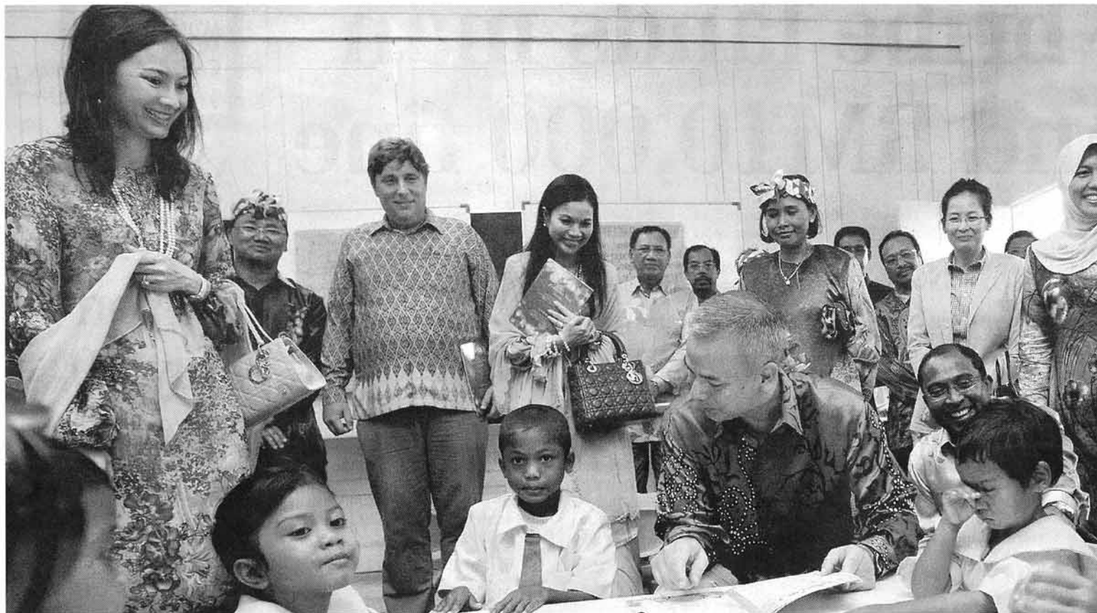
Raja Muda of Perak Raja Dr Nazrin Shah (seated, third from right) chatting with Orang Asli pupils at the Simpang Pulai Orang Asli Excellent Education Centre in Kampung Kerawat, Ipoh, yesterday. With them are Raja Nazrin's consort, Tuanku Zara Salim (left), and Perak Menteri Besar Datuk Seri Dr Zambry Abd Kadir (seated, second from right).